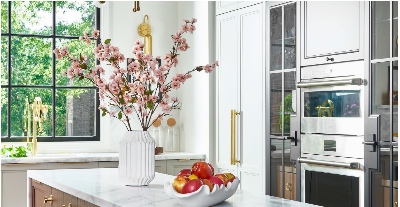
Design: Jerel Lake | Photo: Marc Mauldin

CEUs provide the opportunity for individuals to have recognition of their efforts to update or broaden their occupational knowledge, skills or attitudes. By ensuring that all certified designers maintain an adequate level of knowledge, the NKBA will assist in building consumer confidence and trust in the profession. Both designers and consumers are better protected in a highly educated marketplace.