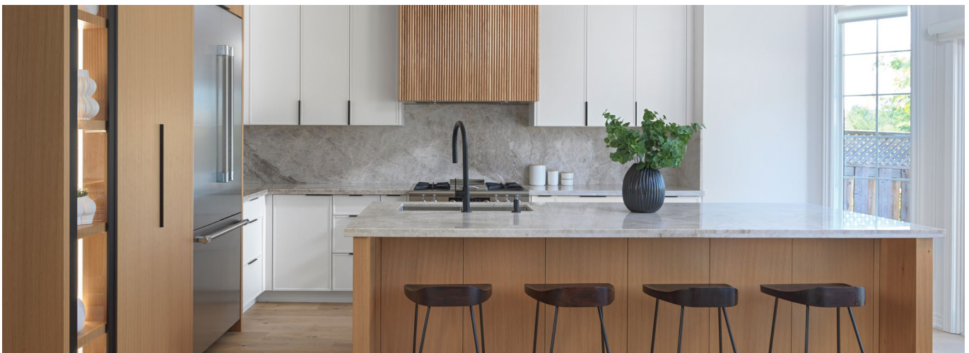
Design: Angel Yalda

*Activities and events such as holiday parties, awards presentations, trade shows or entering contests DO NOT qualify for CEU credits. The certified member must be on the receiving end of some type of formal education in a structured or self-directed environment.